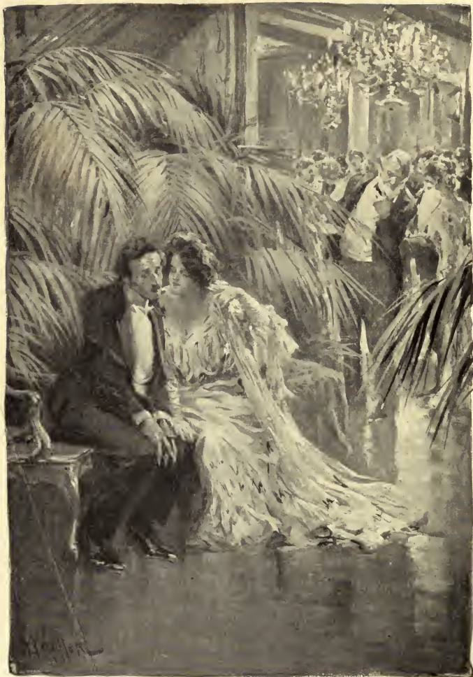
THE CONVERSION OF THE SENATOR FROM STACKPOLE